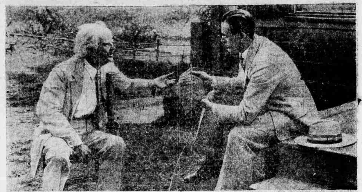
"Every Old-Timer knows that the HEART-LEAVES make the smoothest smoke"

HEART-LEAF Quality throughout... in both Domestic and Imported Tobacco