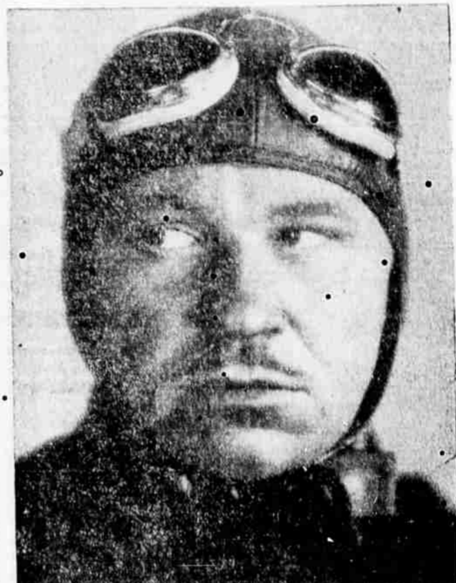
WALLACE BEERY transports pilot No. 3298, now appearing in "Tong War" tells how the movie stars are guarding their throats with OLD GOLDS.

"A year or so ago, Hollywood didn't think much about its vocal chords or its voices. We were all in the silent drama then.