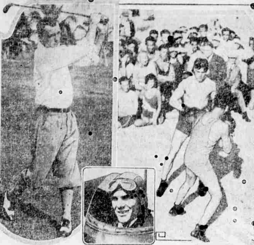
Jack Sharkey, Boston heavy weight, and Young Stribling, Georgia battler, are training for their coming bout in Florida. Jack is shown at the left playing on the Miami links. At right, Stribling is shown working out at his camp. Inset shows Stribling in flying togs before Jack Dempsey obtained an injunction against his flying.