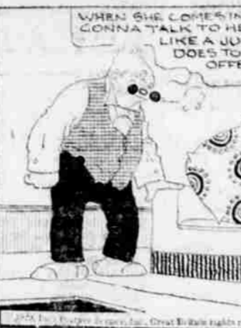
WHEN SHE COMES IN I'LL CONNJA TALK TO HER LIKE A JUDGE DOES TO A FIRST OFFENDER.