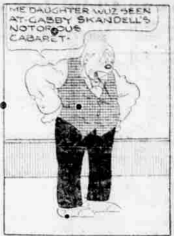
THE DAUGHTER WUZ SEEN AT GABBY SKANDELL'S NOTORIOUS CABARET.