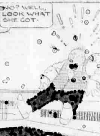
NO? WELL, LOOK WHAT SHE GOT.