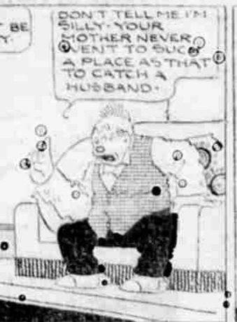
DON'T TELL ME I'M SILLY, YOUR MOTHER NEVER WENT TO SUCH A PLACE AS THAT TO CATCH A HUSBAND.