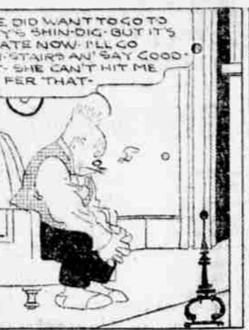
I SURE DID WANT TO GO TO CLANCY'S SHIN-DIG, BUT IT'S TOO LATE NOW. I'LL GO DOWN-STAIRS AN' SAY GOOD-NIGHT. SHE CAN'T HIT ME FOR THAT.