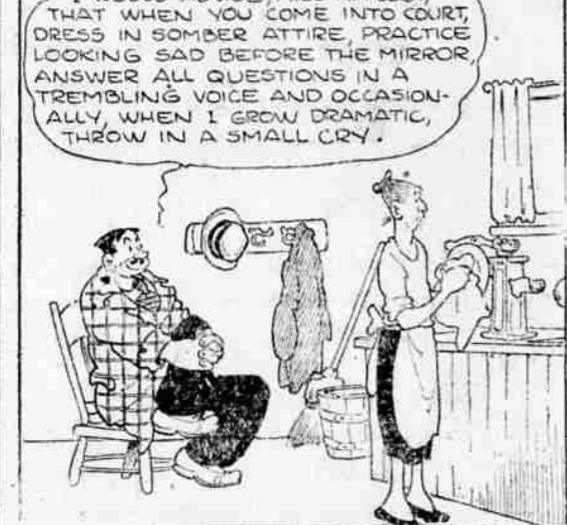
I WOULD ADVISE, MISS APPLEBY, THAT WHEN YOU COME INTO COURT, DRESS IN SOMBER ATTIRE, PRACTICE LOOKING SAD BEFORE THE MIRROR, ANSWER ALL QUESTIONS IN A TREMBLING VOICE AND OCCASIONALLY WHEN I GROW DRAMATIC, THROW IN A SMALL CRY.