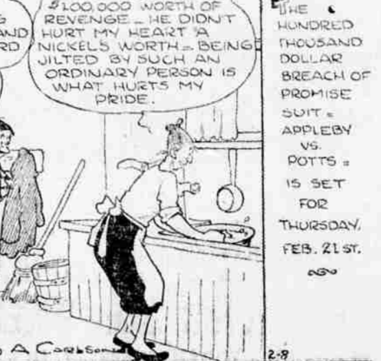
IM SUING FOR $100,000 WORTH OF REVENGE—HE DIDNT HURT MY HEART—BEING JILTED BY SUCH AN ORDINARY PERSON IS WHAT HURTS MY PRIDE.