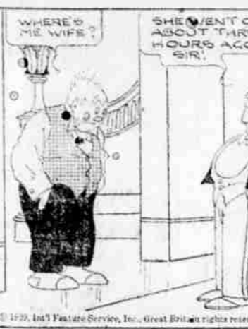
WHERE'S MY WIFE? SHE WENT OUT ABOUT THREE HOURS AGO, SIR.