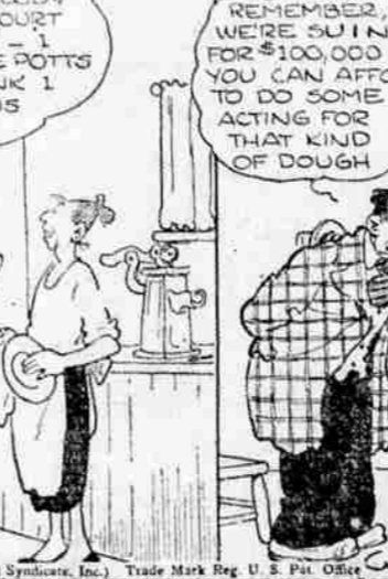
YOU MUST REMEMBER, WE'RE SUING FOR $100,000 AND YOU CAN AFFORD TO DO SOME ACTING FOR THAT KIND OF DOUGH.