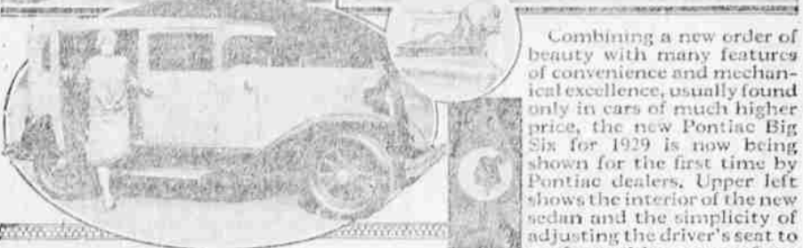
Combining a new order of beauty with many features of convenience and mechanical excellence, usually found only in cars of much higher price, the new Pontiac Big Six for 1929 is now being shown for the first time by Pontiac dealers. Upper left shows the interior of the new sedan and the simplicity of adjusting the driver's seat to conform with a person of any stature; upper right, the coupe with beautiful new radiator cap and tire cover emblem.