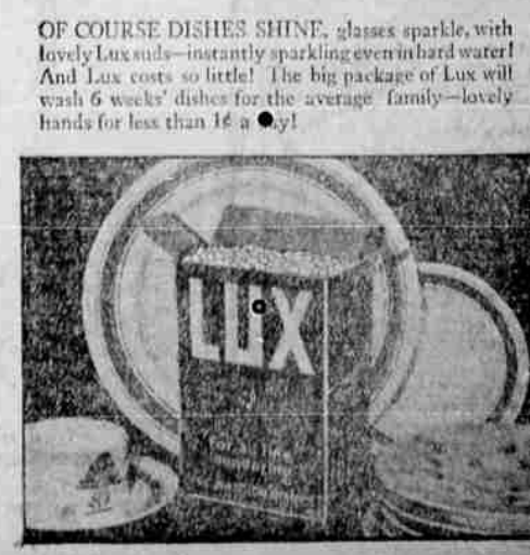
OF COURSE DISHES SHINE, glasses sparkle, with lovely Lux suds—instantly sparkling even in hard water! And Lux costs so little! The big package of Lux will wash 6 weeks' dishes for the average family—lovely hands for less than 1¢ a day!

NOBODY has a better chance to compare women's hands than the experts in these famous beauty shops all over the country! And they find that— "Lux for dishes means hands that are truly lovely—soft and white as the hands of leisure." Here is beauty care in your dishpan! While you are washing dishes with gentle soothing Lux suds, your hands are gaining a half-hour or more of real beauty care! The secret is this: Lux is different from other soaps! It cherishes the delicate oils of the skin, while so many soaps pitilessly dry these beauty oils—leave the skin roughened and red looking. Best of all, this wise, simple beauty care costs almost nothing. Lux for all your dishes less than 1¢ a day! Here is the wise, most inexpensive beauty care known—right in your own dishpan!