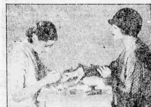
FAMOUS BEAUTY SCHOOLS also find Lux gentle to the hands! The National Schools of Cosmeticians chose Lux for use in manicuring because Lux suds proved most soothing! "There is no better beauty aid than Lux in washing dishes," they add.

Yeast may be kept perfectly fresh for at least a week or ten days by immersing the cake in cold water. The particles of yeast settle at the bottom and water acts as a seal from the air.