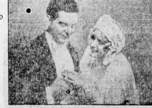
© 1929 by Lever Bros. Co., Cambridge, Mass.

96 OUT OF EVERY 100 BRIDES questioned in 11 great cities are using Lux for their dishes, to keep their hands truly lovely! These modern girls mean to keep house without losing a bit of youthful charm. They find Lux means beauty care!