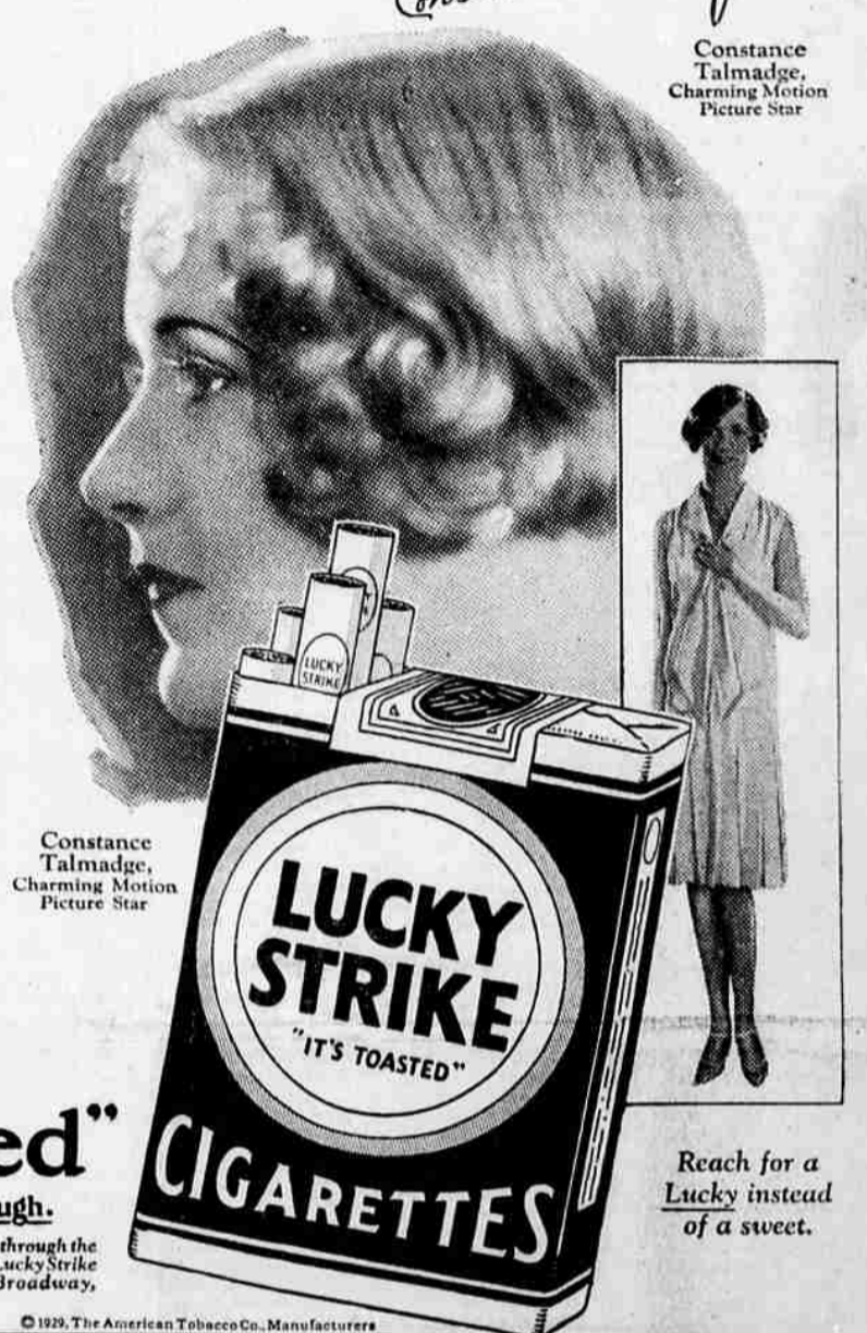
Constance Talmadge, Charming Motion Picture Star

Coast to coast radio hook-up every Saturday night through the National Broadcasting Company's network. The Lucky Strike Dance Orchestra in "The Tunes that made Broadway, Broadway."