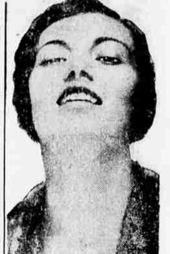
Never has colds

Keep your system in good condition—protect your nose and throat. There is no use worrying all winter for fear you will catch cold or get "flu". Do the following two things and forget it: First, keep your system in good condition, and second, keep your nose and throat well protected.