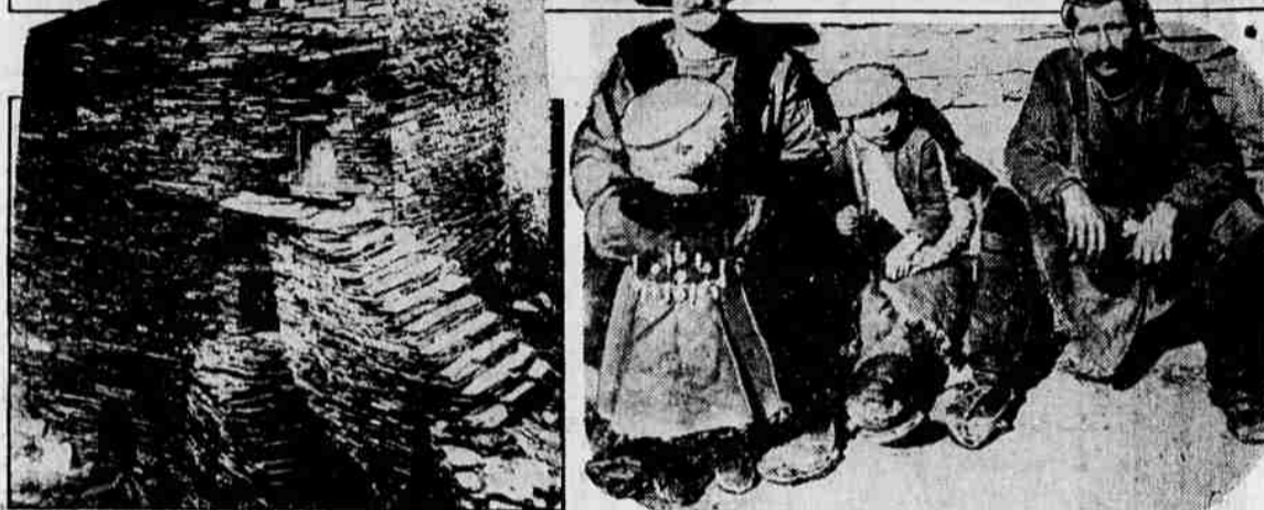
DESCENDANTS OF THE ANCIENT CRUSADERS, LONG ISOLATED, have been found living in almost inaccessible regions of the Caucasus Mountains. They are the Havsour tribe, whose features, dress and customs lead archaeologists to believe they descended from the knights who accompanied Geoffrey de Bouillon. Above is shown their chief village, Chatil. Below, at the left, is an example of one of their houses; at the right is a Havsour family.