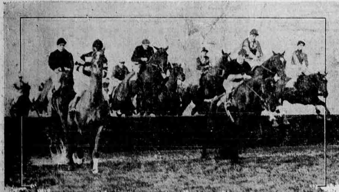
THUNDERING HOOPS WARN THE DARING RIDERS OF THE DANGERS OF A FALL as runners in the "Moderate Chase" clear the first water jump en masse in a steeplechasing meet at Newbury, England.