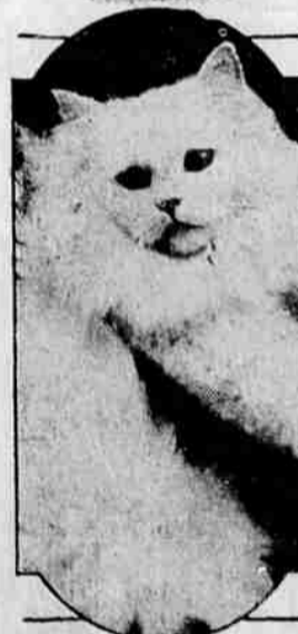
QUEEN OF CATS is the aristocratic "Lotus Blue Bell," first prize winner at the National Cat Club's Show, London.