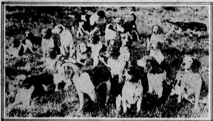
IMPATIENT FOR A DASH 'CROSS COUNTRY, these hounds sniff the air as they wait for the opening meet of the Worcester Park Beagles, Surrey, England.