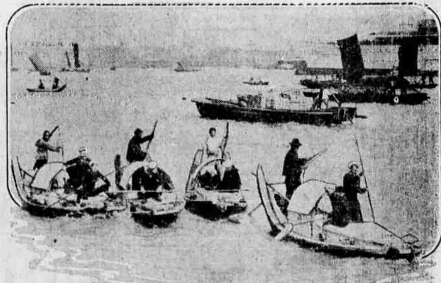
THE SAILOR'S LIFE ISN'T HALF BAD, what with funny little boats to ride around in, in everything. Here's a group of gobs from the U. S. Asiatic fleet, going ashore in sampans in the Whangpoo river, Shanghai, China.