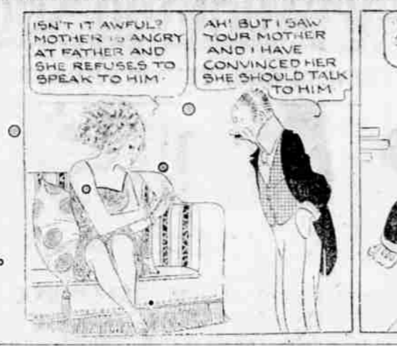
THE NEBBS—It's Everybody's Business Now