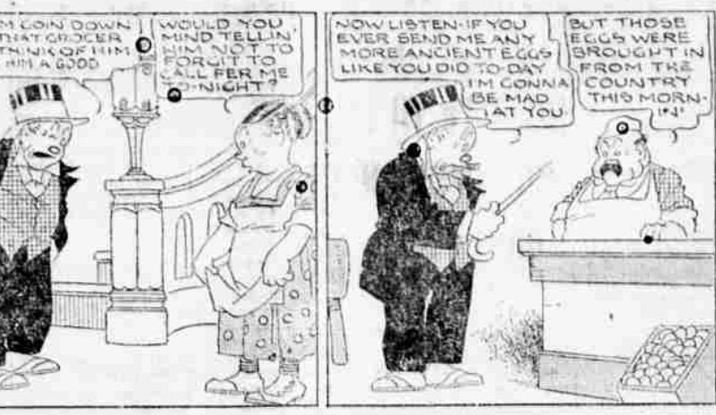
By SOL HESS