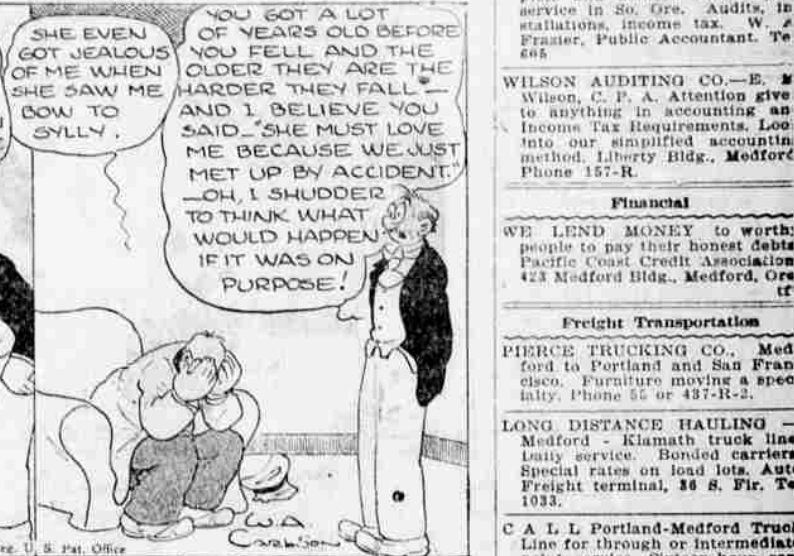
By SOL HESS

THE NEBBS—The Dam Has Burst. HERE WE HAVE NEBS AND POTTS AND THEY ARE GOING TO OPEN THE PACKAGE CONTAINING THE POTTS BONDS. HOLD YOUR BREATH.