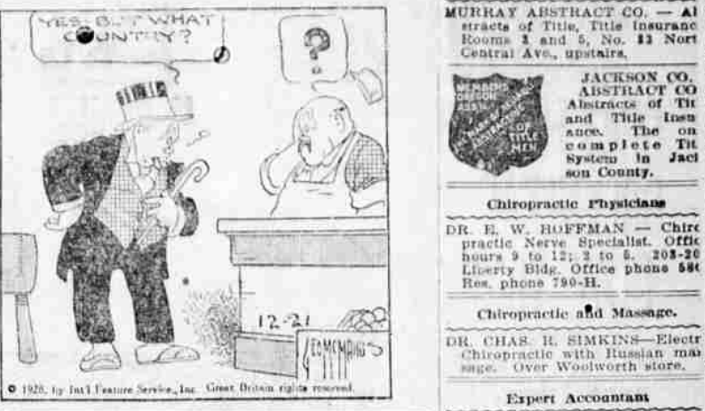
By SOL HESS