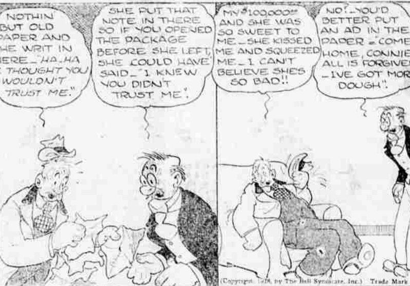
By SOL HESS