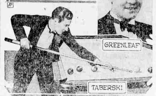
Here are four of the eight cue stars who will match wits for two world titles in a round-robin tournament in Chicago, beginning today.