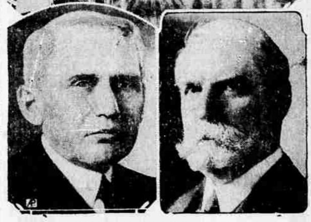
General principles of arbitration of disputes between Latin American nations will be developed at the International Conference of American States on Arbitration and Conciliation at Washington, D. C., in "The Hall of the Americas" (above), Pan-American Union building. Secretary Kellogg (lower left) and Charles Evans Hughes (right) will be American delegates.