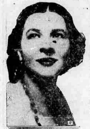
GANNA WALSKA, comedienne, she will sing from WEAF and stations. Each will give four numbers. One Miss Walska's program will be Elizabeth's entrance aria from "Tannhauser."

NEW YORK (AP)—Ganna Walska, operatic singer, is to make her first radio appearance on Thanksgiving afternoon. With Miss Belle Baker, singing