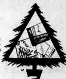
Table Linen for Gifts

A very special price, as they are pure linen, hand drawn threads and hand embroidered work. An elegant set of cloth and four napkins.