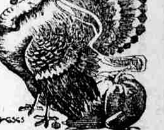
festival. The "Harvest Home" is celebrated in England on September 24.