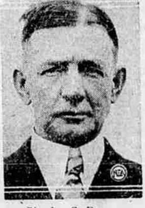
Charles G. Dawes