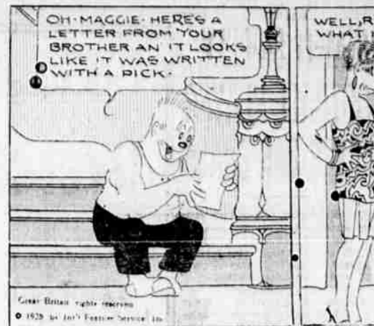
THE NEBBS—The Great Lover