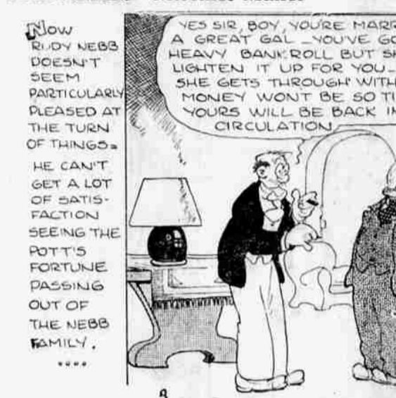
THE NEBBS FAMILY