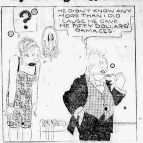
THE NEBBS—Mischief Maker