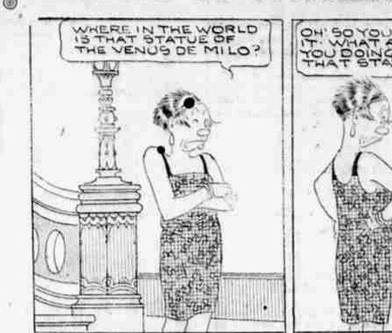
THE NEBBS—Mischief Maker