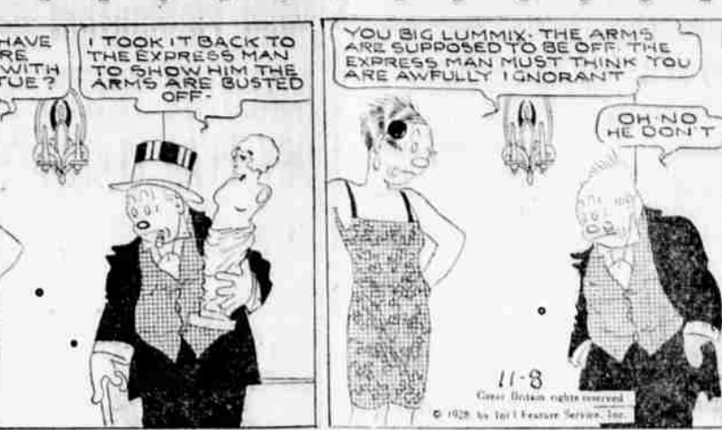
THE NEBBS—Mischief Maker