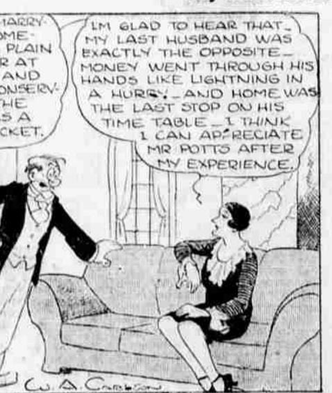
THE NEBBS—Mischief Maker