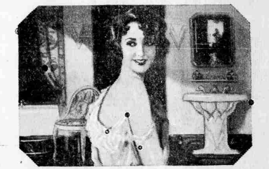
Bebe Daniels (Paramount) and the bathroom her charm inspired

More Fruit Forward. WASHINGTON (AP)—Statistics compiled by the department of agriculture indicate a remarkable expansion in the fruit and vegetable industry. Changing food habits of the American people and the ability to buy products formerly considered luxuries are credited for the increase.