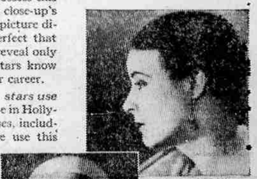
VIRGINIA VALLI, the beautiful star, says—"I get delight in the marvelous velvety way Lux Toilet Soap leaves my skin."

NINE out of ten screen stars use it for smooth skin.