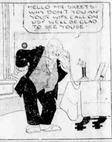
THE NEBBS—The Rich Mr. Potts