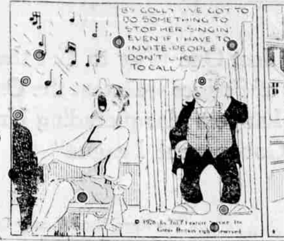
THE NEBBS—The Rich Mr. Potts