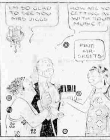
THE NEBBS—The Rich Mr. Potts