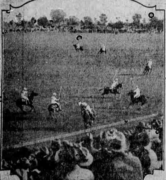
PONIES PRANCE AND RIDERS LEAN as the American and Argentine teams contend for the world's polo championship. This picture was taken during the second game, won by the Argentines; the U. S. took the other two games and the title.