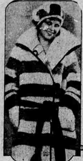
WELL DRESSED Canadian girls this winter will wear coats of red and white brushed wool, like this one—that is, they will if they're lucky. This one is displayed by Miss Barbara Kent, movie star.