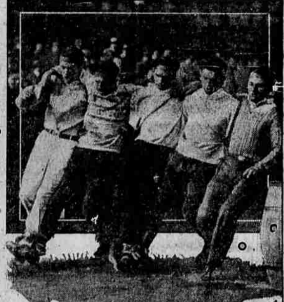
THIS HARDLY LOOKS SENSIBLE, but what do you expect at a college flag rush and field day? This shows the freshman team at Northeastern University, Boston, winning the six-legged race in the annual inter-class competition.