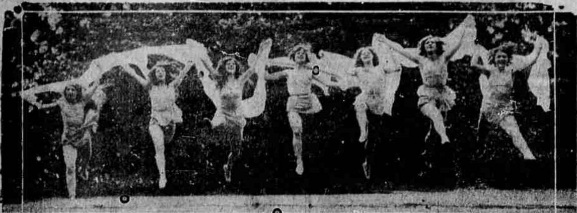
SPRING WON'T BE HERE FOR MANY A FROST-BOUND MONTH, but there isn't any harm in practicing so you'll know how to greet it. That, at least, must be the idea back of this festive dance staged by these Albertina Rasch chorus girls.