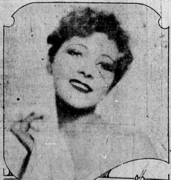
THEY'VE GONE CRAZY OVER HER, have the film executives—and Miss Helen Twelvetrees, now beginning her movie career, is believed to have a brilliant future assured.