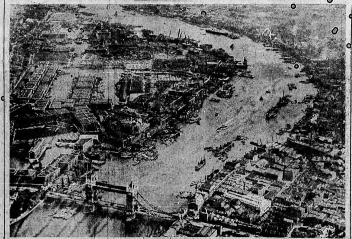
HOME PORT OF MERCHANT SHIPS SINCE THE DAYS OF FROBISHER and Drake, the famous "pool" of London, surrounded by tiers of warehouses, is shown here in the left center, with the river Thames winding around to the right and the famous Tower bridge in the foreground.