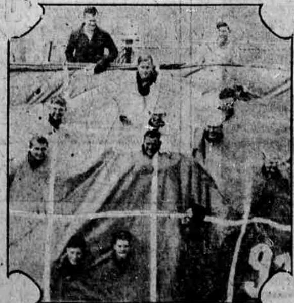
SHOT FULL OF HOLES is this target, which got riddled when the U. S. S. California unloaded her broadsides at it off the Pacific coast recently. Poking their heads through the holes are sailors from the gun crews that did the shooting.