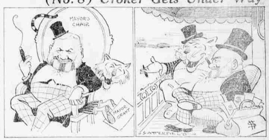
1. Croker's brother-in-law testified Croker paid bribe $100,000 a job. 2. Mayor Grant gave cash in envelopes to Croker's daughter as bribe money. 3. Croker reflected Grant mayor despite revelations of dishonesty. 4. Five years after becoming boss Croker travelled in private cars.