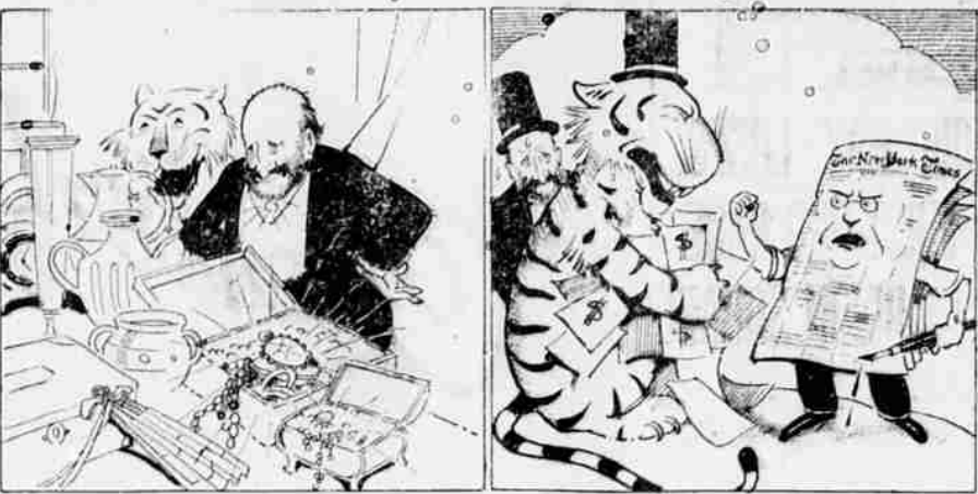
1. Tweed gave a wad of cash to his daughter at which presents totalled $700,000. 2. Tammany offered N. Y. Times $5,000,000 to suppress its publication of graft. 3. Then bundles of tell-tale vouchers were "stolen" from city comptroller. 4. Finally 70 outraged citizens enjoined city treasurer to stop the looting.