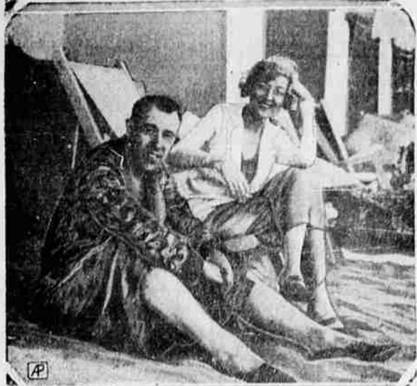
Peggy Hopkins Joyce with Lord Northesk on the beach at Lido Venice, Italian summer resort. Miss Joyce recently announced she and Lord Northesk intend to marry.

NEW YORK, Oct. 18.—(AP)—Notwithstanding her plans to become Lady Northesk, Peggy Joyce