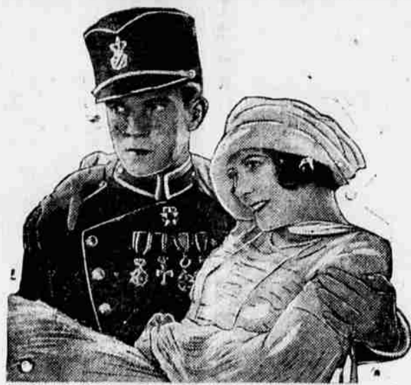
RAMON NOVARRO and RENEE ADOREE in "FORBIDDEN HOURS"

A closeup of the human soul hidden from the world under the ermine robes of a monarch—this is the glimpse, seldom given the world, that Ramon Novarro offers playgoers in his latest vehicle, "Forbidden Hours," now playing at the Rialto theatre.