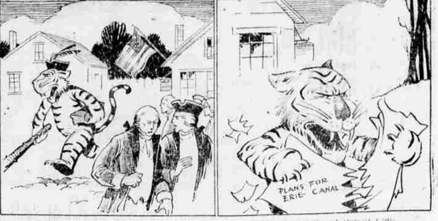
2. Tammany men seconded Burr and celebrated Hamilton's death.