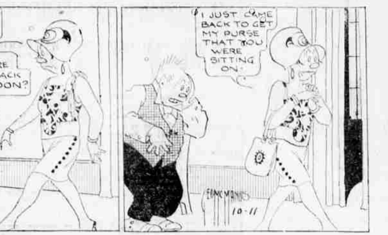
THE NEBBS—The Widow's "Night"