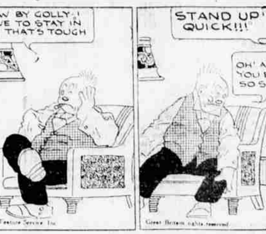
THE NEBBS—The Widow's "Night"