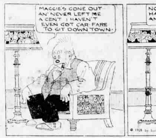
THE NEBBS—The Widow's "Night"