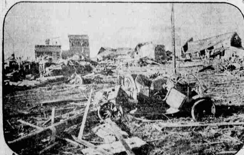
THIS IS ALL THAT IS LEFT OF THE BUSINESS SECTION of the thriving town of Davis, S. D., struck with devastating force by a tornado the other day. Note how the automobiles shown were wrecked by the blast.