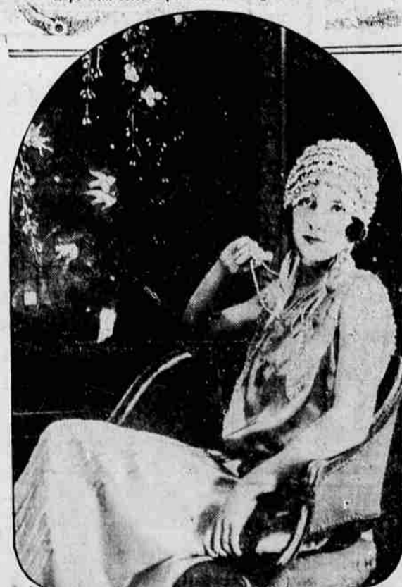
DELICATE COLORS AND FABRICS combined with laces are used in this dainty sleeveless night dress of peach colored satin, displayed by a New York importer. The fully bouclair cap is made to match.