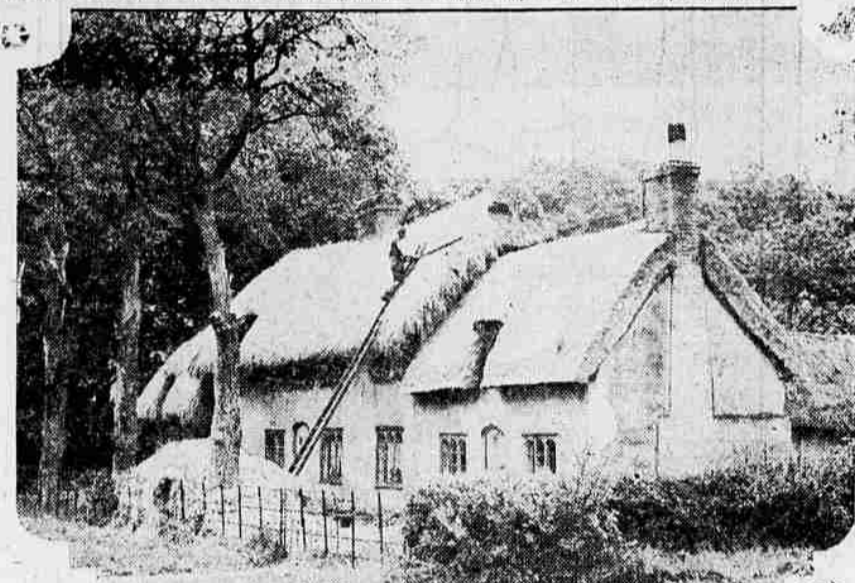
THE QUIET BEAUTY OF THE ENGLAND THAT USED TO BE still exists in quiet corners of the British countryside. Here is a thatcher, hard at work renewing the straw roof of a farmhouse in East Anglia. Modern roofing construction has not yet displaced the thatcher from his ancient calling.