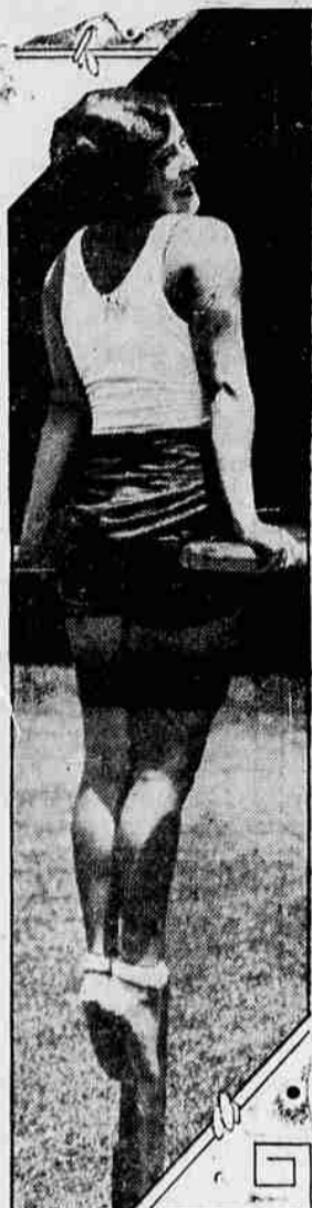
GOOD FORM is everything in gymnasium work, thinks Kathryn Crawford, movie star. So she practices every day—or something like that—on the horizontal bar in her own back yard.