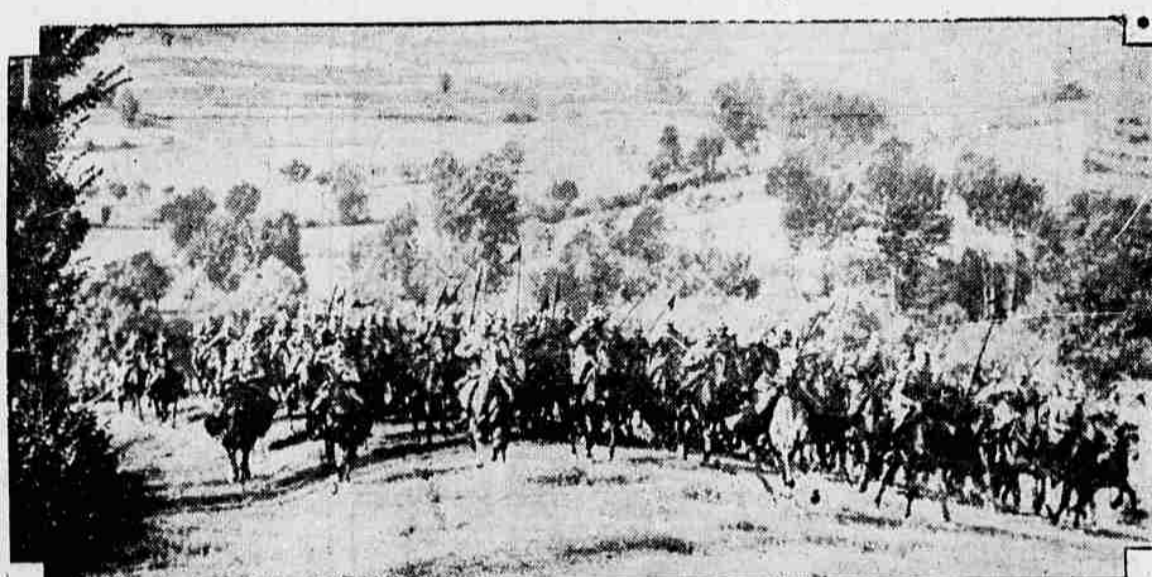
MAGNIFICENTLY THRILLING, EVEN IF SOMEWHAT OUT OF DATE, the cavalry comes thundering up the slope with colored pennons fluttering from tilted lances. The picture was taken during recent maneuvers of the Italian army.