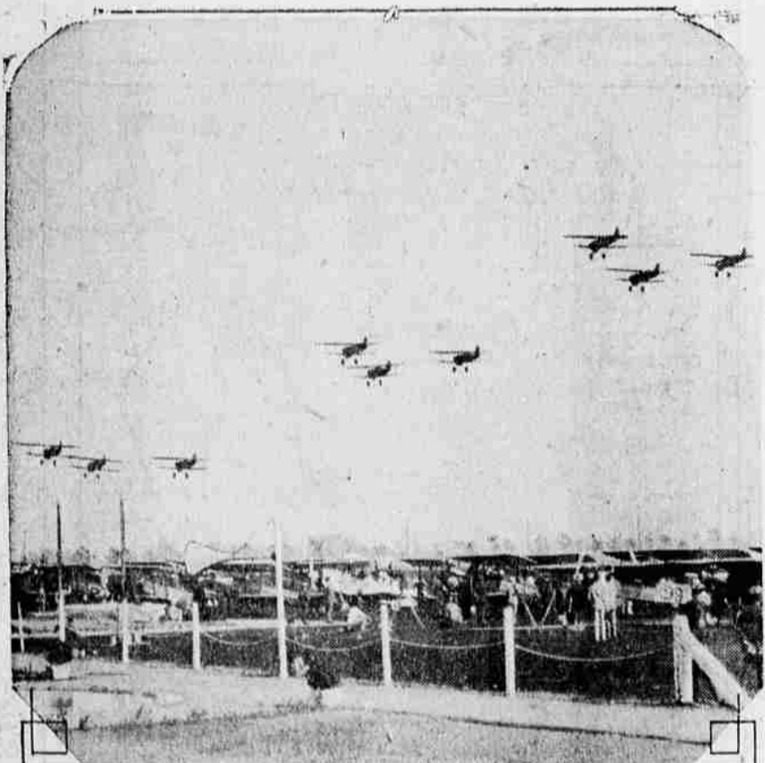
SWOOPING DOWN IN AN IMPRESSIVE WELCOME, these U. S. navy pursuit planes circle close over the field, in battle formation, at the close of the National Air Derby at Los Angeles. Parked below are planes that participated in the Class A division of the race.