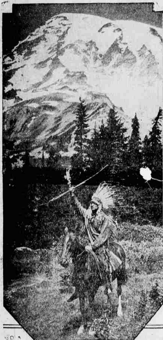
THE MOUNTAIN THAT WAS GOD, as the Indians used to call Mount Rainier, looms majestically back of this red-skinned warrior who, dressed in the garb of his ancestor, poses for a moment beside a little pool in Rainier National Park.