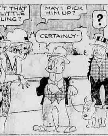
THE NEBBS—The Skeptic