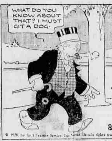
THE NEBBS—The Skeptic