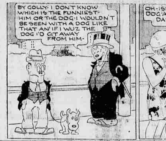
THE NEBBS—The Skeptic