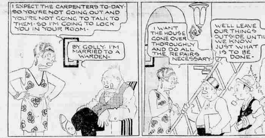
THE NEBBS—So Near and Yet So Far