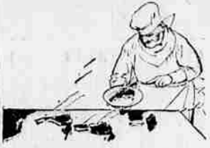
Watch the chef broil chops

REICHSTEIN AND DEUEL WOOD ALL KINDS OF DRY WOOD OAK-LAUREL-FIR Summer COAL Prices GREEN PINE SLABS MEDFORD FUEL CO. 1118 North Central Tel. 631