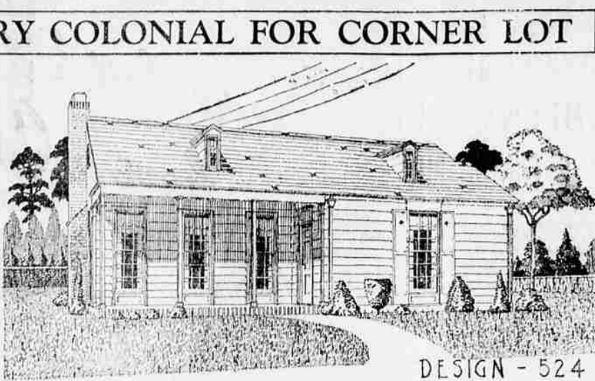
DESIGN - 524

PORTLAND—Southern Pacific starts new train on Marshfield run.