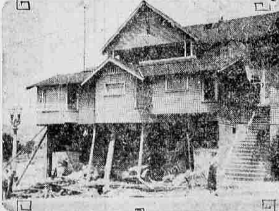
The lower story completely wrecked, the side of the lower floor fallen away, two automobiles all but buried beneath an avalanche of rocks and dirt that fell in when the lower story collapsed, this Los Angeles, Cal., house, nevertheless, was not damaged in its upper stories and remains standing apparently as firmly as when the lower story was in place to support it. The props seen below were put there by firemen who feared the weakened structure might collapse.