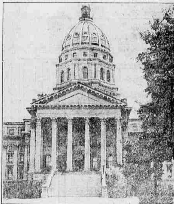
Thousands of friends and neighbors of Senator Charles Curtis will gather at the State Capitol Building in Topeka, Kansas, on August 18th, when the Republican vice-presidential nominee will be notified officially of his nomination.