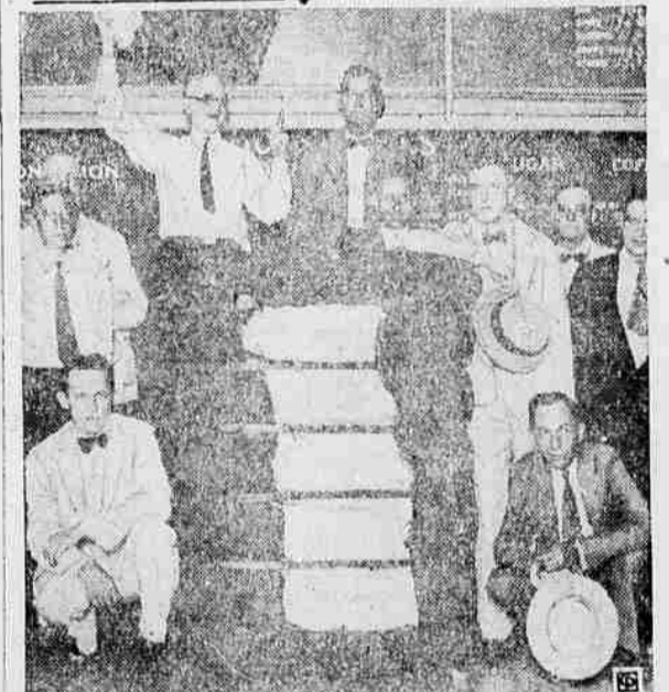
This bale of cotton has created a difference of opinion in Democratic circles. The New York Cotton Exchange has refused to comply with the request of an Atlanta commercial exchange to have the first bale of Georgia cotton of the season auctioned on the floor of the exchange and the proceeds turned over to the Democratic campaign fund, on the grounds that the exchange is not a partisan organization. Photo shows the cotton bale before it was sent from Atlanta by air mail.