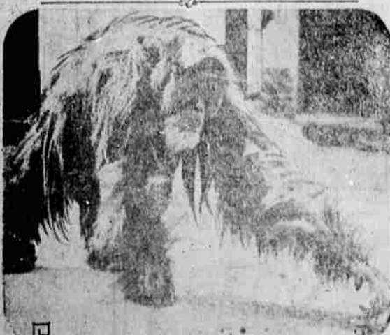
An orang-utang, latest addition to the zoo at Rome, Italy, out for a morning walk.