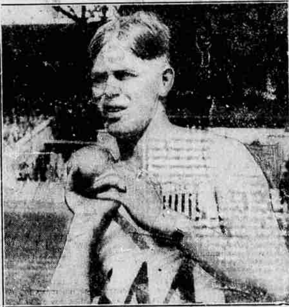
John Kuck, weight star of the Los Angeles A. C., captured the Olympic shot put championship for the United States and set a new world's record with a heave of 52 feet 11/16 inches.