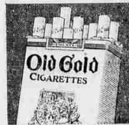
Old Gold CIGARETTES D. P. Lorillard Co., Est. 1760 Made from the heart-leaves of the tobacco plant

Why you can pick them . . . . . in the dark!