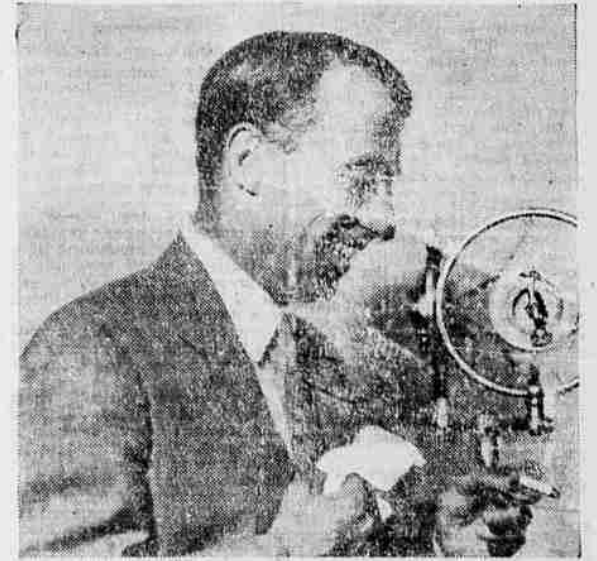
GRAHAM McNAMEE, America's most popular radio sports reporter, recently reported the Tommy Heeney fight, to which millions of radio fans all over the world listened.