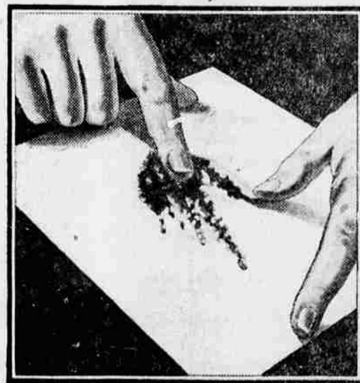
Carbon deposited by ordinary oil is hard, flinty. It will tear paper; it will scratch brass—wear away steel