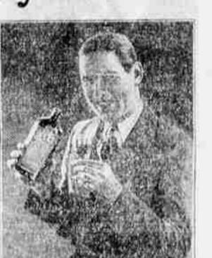
"Now! I am right."

to its benefit in unsolicited letters of gratitude.