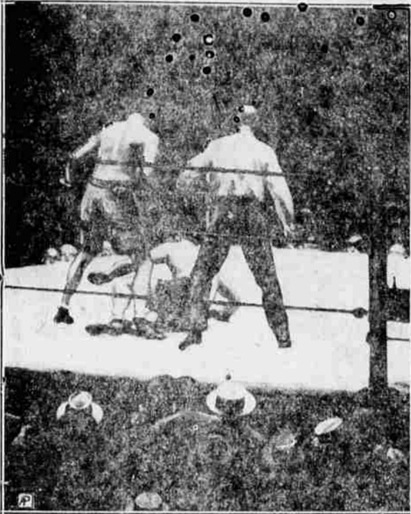
Tom Heenev, New Zealand challenger, is shown on the floor after he had slipped in the fifth round following an exchange of blows with Gene Tunney during their championship bout at Yankee stadium. Heenev was up without count.