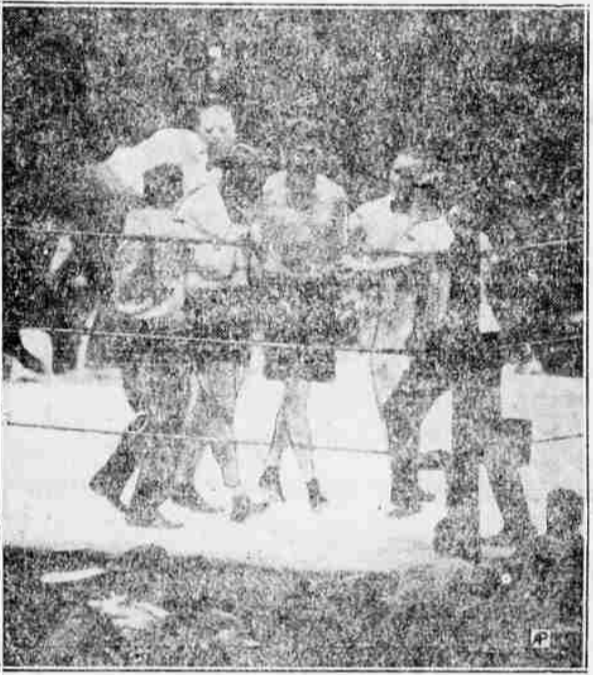
Gene Tunney still wore his heavyweight championship crown when he left the ring at Yankee stadium after winning from Tom Heenev. Picture shows the champion and Heenev being escorted from the ring after the fight had been halted in the eleventh round to save Heenev from further punishment.