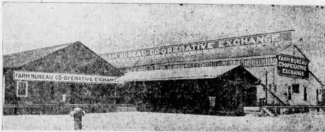
View of Southern Oregon's Farm Bureau Exchange Buildings.

Owned by 500 farmers in Jackson and Josephine Counties—a Co-operative Institution for the benefit of the grower. We can help you.