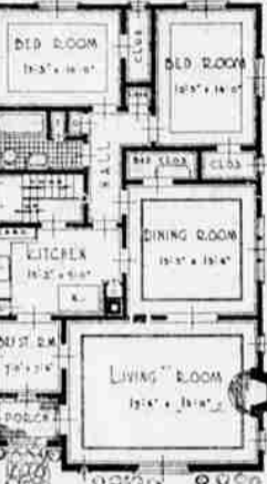
ROOF TREATMENT ADDS TO APPEARANCE SIZE

The design for this week illustrates one of the most popular