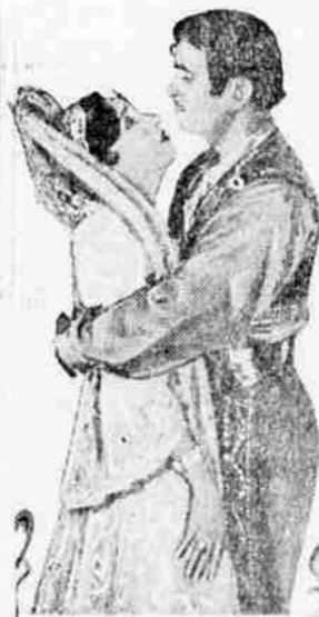
DOUGLAS FAIRBANKS as THE GAUCHO

Don't appear as an outlaw gaucho leader, head of a band of hard-riding bandits, who occupy the mysterious shadow city.