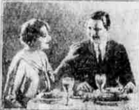
Now! mealtime is a happy event strong, and your nerves become steady.

If you do not enjoy your food it is a true sign that you are losing your appetite. And when your appetite is "gone" it means you haven't the resistance to ward off diseases. Loss of appetite is only a symptom. General weakness pervades the entire body. There is no desire to work or play.