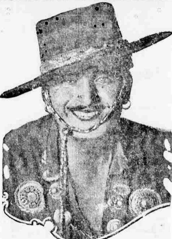
'DOUGLAS FAIRBANKS as THE GAUCHO'

Film enthusiasts will welcome the appearance of Douglas Fairbanks tomorrow at Hunt's Craterian theatre, when from all indications, seating accommodations will be taxed to the limit.