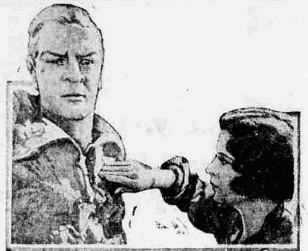
Scene From "The Lion and the Mouse" with May McAvoy and Lionel Barrymore