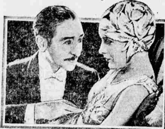
ADOLPHE MENJOU-EVELYN BRENT IN THE HOBART HENLEY PRODUCTION "HIS TIGER LADY"