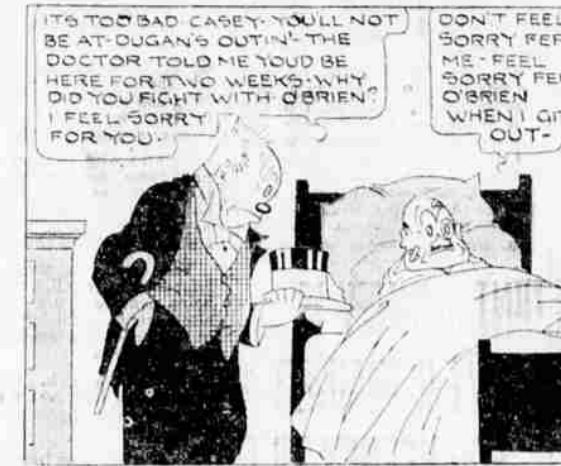
THE NEBBS—The Queen of Diamonds