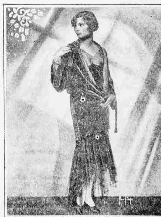
Wool and gown courtesy Stern Bros.