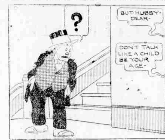
THE NEBBS—The Crust of Society