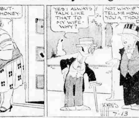
THE NEBBS—The Crust of Society