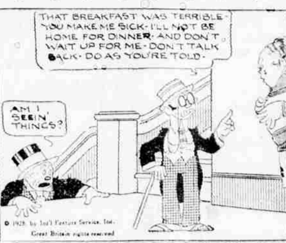
THE NEBBS—The Crust of Society