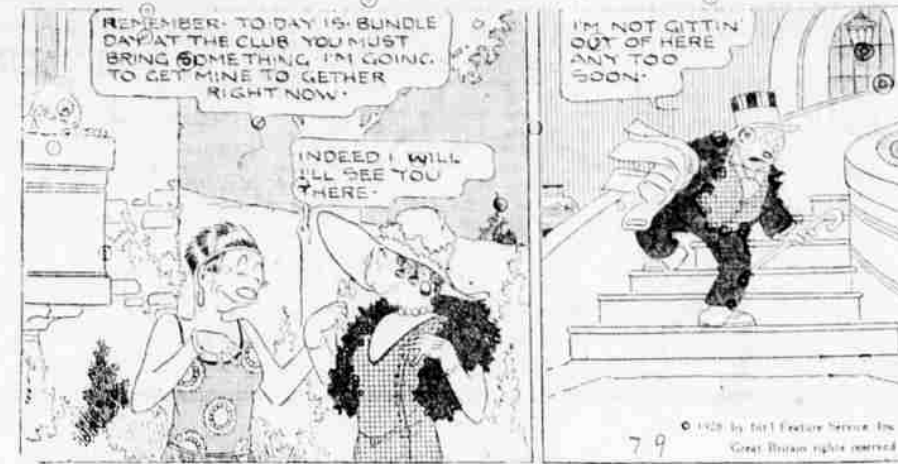
THE NEBBES—Just an Independent Guy