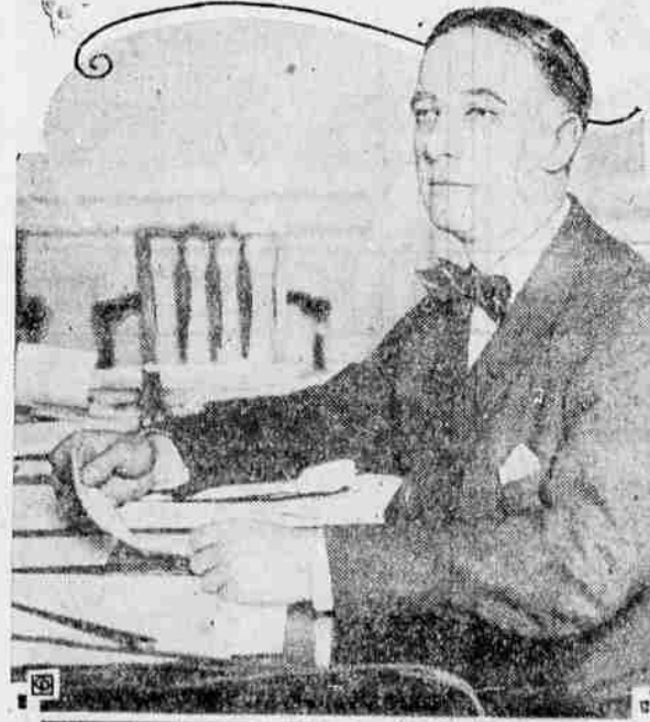
Just a look into the past of Governor Alfred E. Smith, of New York, candidate for the Democratic presidential nomination. It shows Smith at his desk as president of the board of aldermen of New York City in 1918.