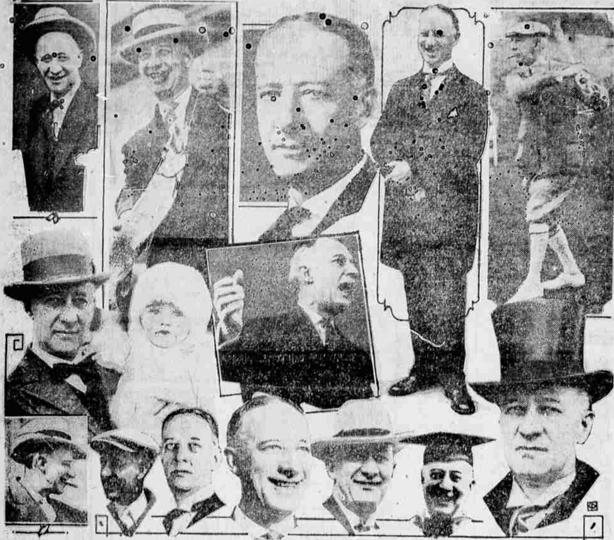
Various poses of Governor Alfred E. Smith of New York, who went into the Democratic national convention, Houston, Texas, as the candidate with the most instructed delegates for the presidential nomination.