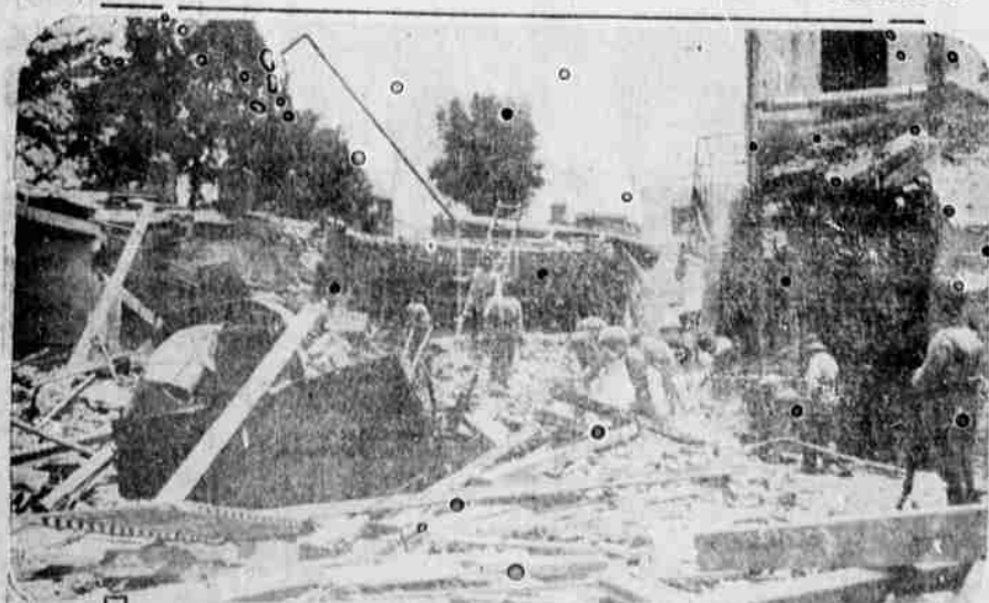
Firemen are seen searching ruins in Mexico City for bodies after boiler explosion in the public baths, which took 28 lives and seriously injured 30. Four buildings were demolished by the blast.