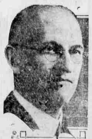
Rear Admiral Hutch I. Cone, above, has been appointed by President Coolidge as a member of U. S. shipping board to succeed Rear Admiral William S. Benson. The change becomes effective in June.