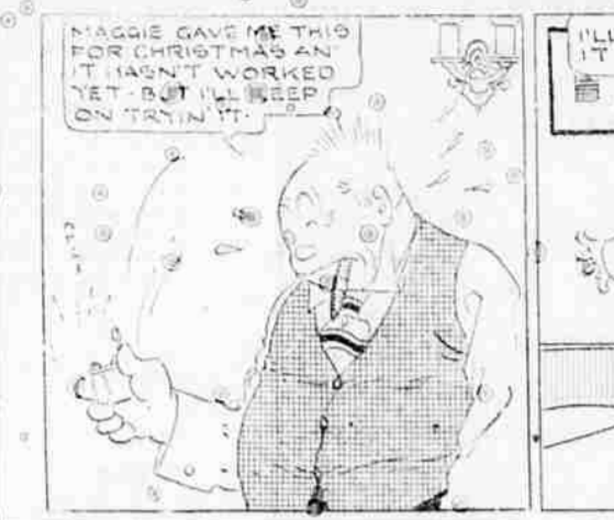
THE NEBBES—Oh, Look Who's Here