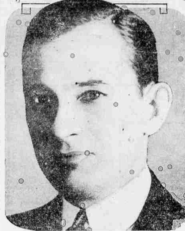
As floor leader of the Smith forces on the convention floor, Mayor Jimmy Walker, of New York, above, is at once one of the most important figures and one of the most popular delegates to the Democratic gathering.