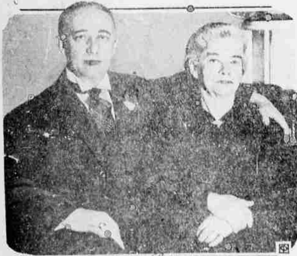
This is one of the latest pictures of Governor Alfred E. Smith, of New York, and candidate for the Democratic presidential nomination, with his aged mother. It was taken at her Brooklyn home in 1924, shortly before her death.