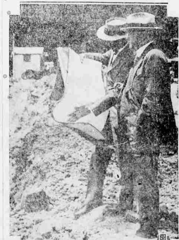
Secretary of Commerce Herbert Hoover, Republican presidential nominee, snapped while looking over the site and plans for the new department of commerce building at Washington, D. C. With him