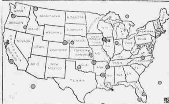
There's rejoicing in the west since the Republican national convention selected Herbert Hoover, secretary of commerce, and Senator Charles Curtis, as its standard bearers, because it is the first time in the history of the party that both candidates have been chosen from states west of the Mississippi. It also is the first presidential from states west of the Mississippi. Map, above, shows Palo Alto, Cal., Hoover's home, and West Branch, Ia., his birthplace; and Topeka, Kan., where Senator Curtis lives.