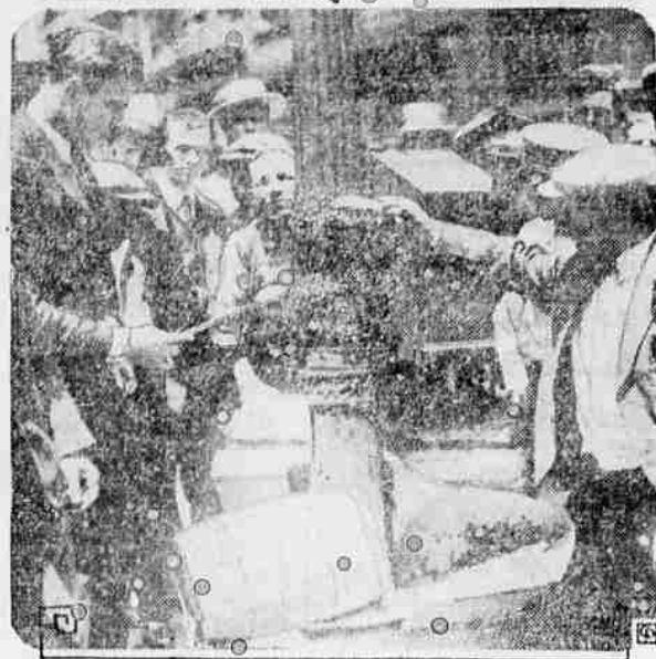
Bzzzz! These bees, swooping down on the business section of Cincinnati, O., are the talk of the city. Above, a few brave individuals are scooping them into a box, while curious city folk look on.