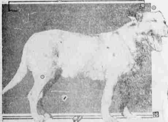
"Tut," pet police dog owned by Secretary of Commerce Herbert Hoover, may be the next White House mascot, if his master succeeds in winning the presidential election in the autumn. "Tut" would like to romp on the White House lawn. He's shown here in front of the Hoover residence at Washington, D. C.